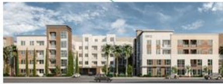
Jefferson on SoLa Joint developer: JPI Location: South Gate (suburbs of Los Angeles) Purpose: Multi-unit residence Units: 244 Commencement of lease: August 2021 (planned)