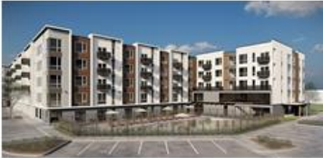
Alexan Alderwood Joint developer: Trammell Crow Residential Location: Lynwood (suburbs of Seattle) Purpose: Multi-unit residence Units: 387 Commencement of lease: January 2023 (planned)