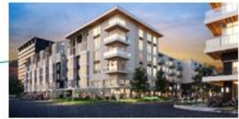
Jefferson Gallery House Joint developer: JPI Location: Dallas Purpose: Multi-unit residence Units: 353 Commencement of lease: August 2021 (planned)