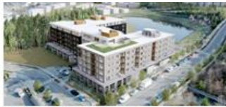
Alexan Heartwood Joint developer: Trammell Crow Residential Location: Issaquah Highlands (suburbs of Seattle) Purpose: Multi-unit residence Units: 135 Commencement of lease: May 2021 (planned)